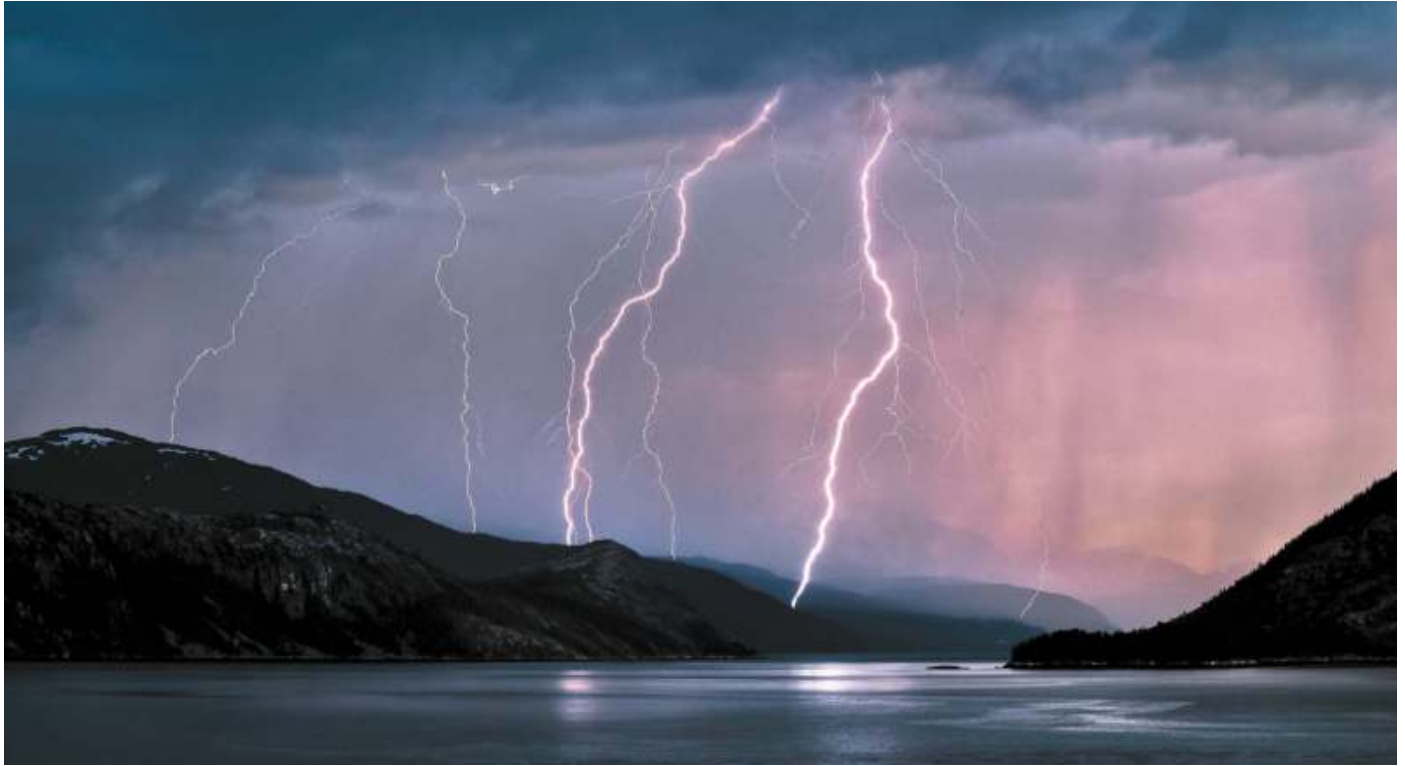
Lightning typically forms with the aid of warm air, which is why it has historically been rare in the Arctic.